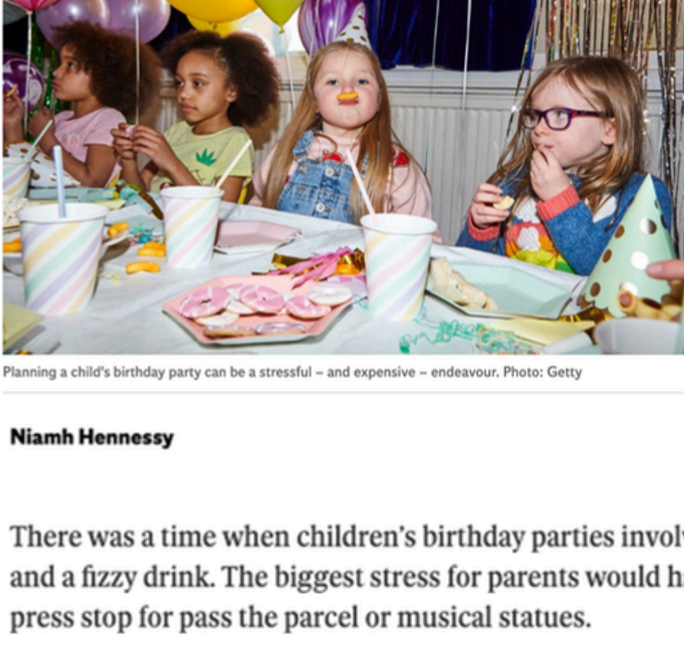
Planning a child's birthday party can be a stressful – and expensive – endeavour.

Budgets can fly out the window when planning a child's birthday party, but there are many ways to keep costs down